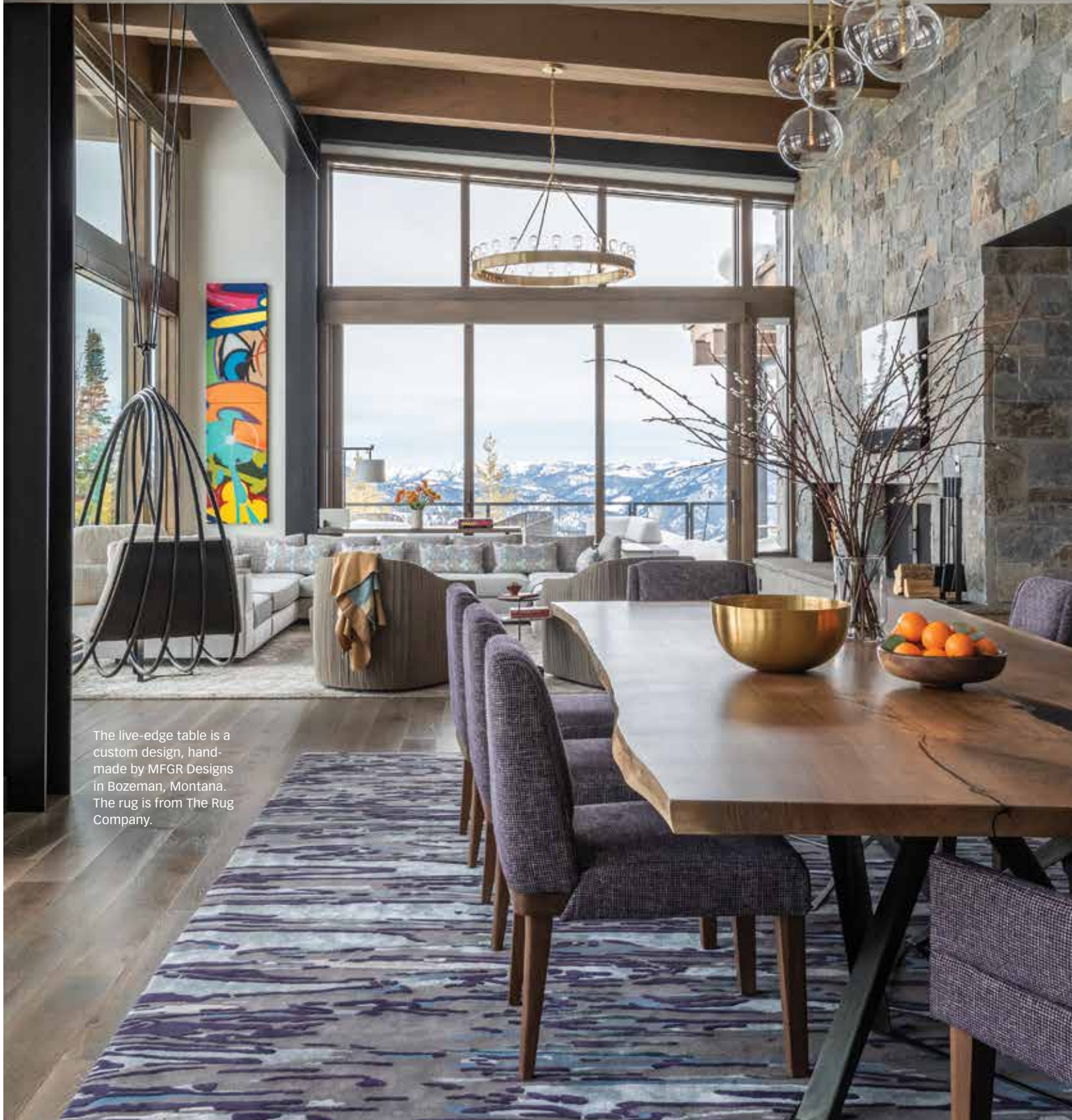
The live-edge table is a custom design, hand-made by MFGR Designs in Bozeman, Montana. The rug is from The Rug Company.